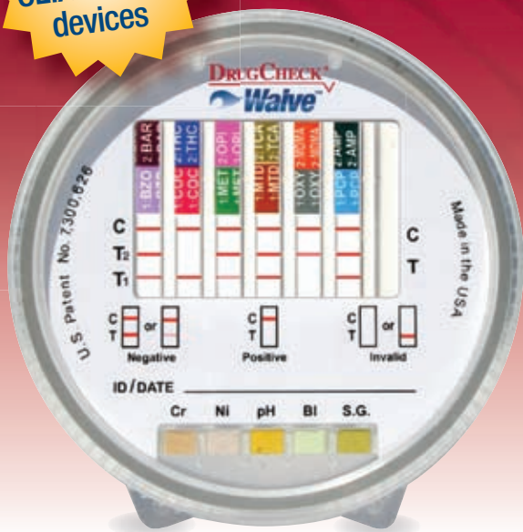
# DCC-81205-5 Example shows positive results for THC and OXY