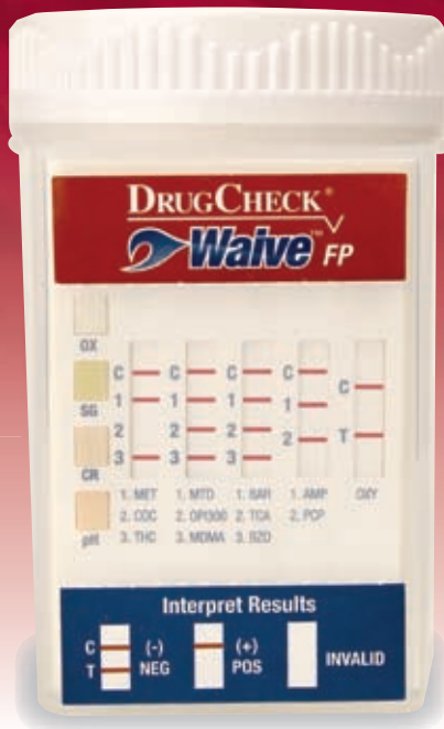
# DC Waive FP 21200-4 Cup example shows positive results for COC